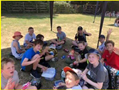
End of Year Picnic We had a lovely end of year picnic despite the sweltering heat.