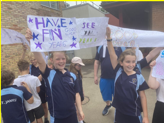
Year 6 Leavers Parade Year 5 loved creating posters to say good bye to Year 6