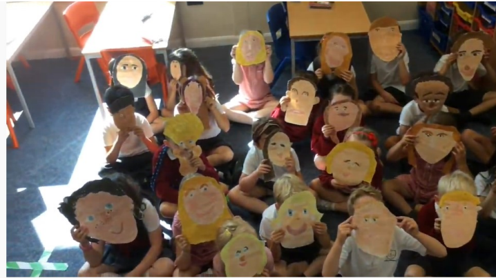
Class 5 assembly Thursday 1st October 2020